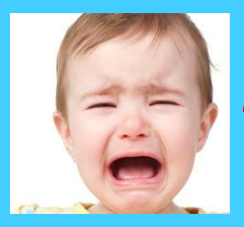
The baby cries loudly.